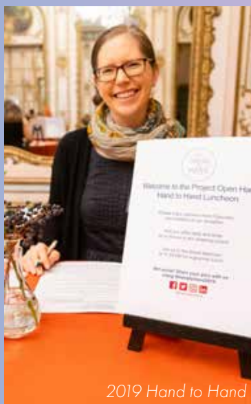
2019 Hand to Hand

Thank you to all our volunteers, staff and dedicated supporters who helped us put on this spectacular event!