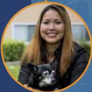
Thuy Wellness Program Client PARKMERCED

This year we received over 1,450 applications from new clients; 90% of our clients live below the poverty level