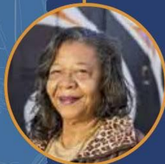
Rossie Wellness Program Client BAYVIEW

This year we received over 1,450 applications from new clients; 90% of our clients live below the poverty level