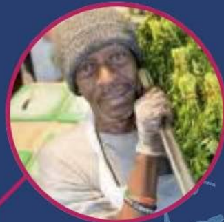
Wilshia Kitchen Volunteer TENDERLOIN

952,751 meals came out of our grocery centers and kitchen in 2017 (Combined total)