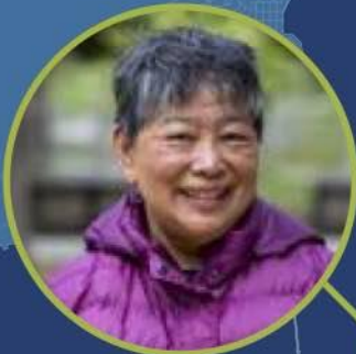
Jane Community Nutrition Program Client RICHMOND DISTRICT

952,751 meals came out of our grocery centers and kitchen in 2017 (Combined total)